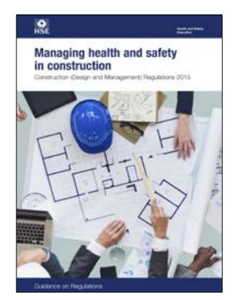
L153 Published 2015

The Construction (Design and Management) Regulations 2015 (CDM 2015) came into force on 6 April 2015, replacing CDM 2007. This publication provides guidance on the legal requirements for CDM 2015 and is available to help anyone with duties under the Regulations. It describes: